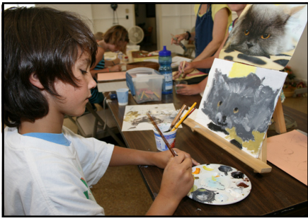
Painting class in Arts Camp 2010