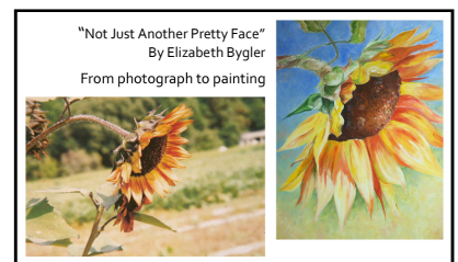
"Not Just Another Pretty Face" By Elizabeth Bygler From photograph to painting

Check the website for additional information Call 540-586-4235 to register! Come by Bower Center for a brochure